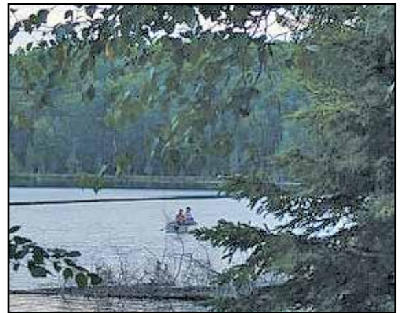
The serenity, beauty, and integrity of Sylvania remains threatened.

In UPEC's view, it is critical that Forest Service wilderness regulations (and specifically the regulation prohibiting use of gas motorboats within wil-