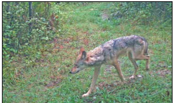
A wolf roaming the Ontonagon River Valley region of the western UP. Last year's wolf hunt had a severe impact on a pack around the east branch of this river system.

The initiative's name is deceptive as it has nothing to do with conservation and it is not based on science. Michigan's own world-renowned wolf scientists have repeatedly rejected the efficacy of using a hunting season to manage