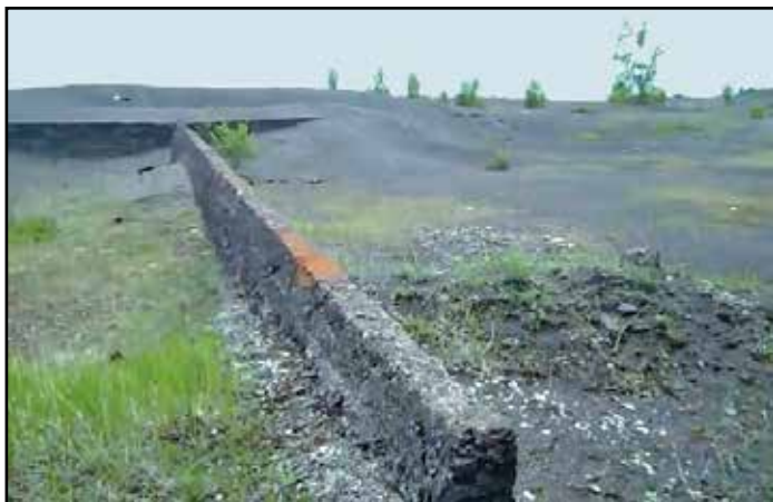
Old retaining wall amid the stamp sands surrounding Gay's abandoned Mohawk Stamp Mill. The sands have degraded a wide beach and benthic zone.

There was a public hearing at the Schoolcraft Township Hall in Lake Linden on June 24 regarding a request by Torch Lake Industries of Hillsdale, Illinois to remove 2.15 million tons of stamp sands from the Lake Super-