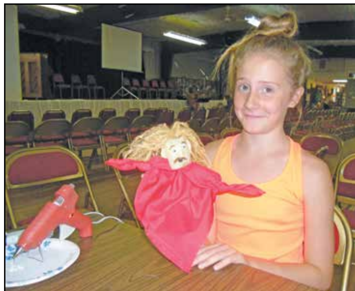
Possibilities abound when it comes to up-cycling! A day camper shows a puppet sourced from a cardboard tube and fabric scraps.

Roger LaBine of the Lac Vieux Desert Band of Lake Superior Chippewa set up an authentic wild rice processing camp and provided hands-on experience with each phase of