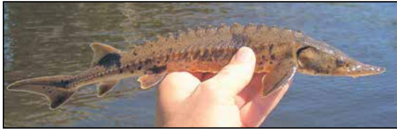
A young sturgeon. The area below Grand Rapids typically produces the most juvenile sturgeon.

Sturgeon spawn in the spring (typically May) and under normal habitat conditions would run out of a large lake up a river. This migratory pattern played a role in a recent mystery that was observed in Menominee River sturgeon. A few adult fish were found floating in the lower sections of the river with fractured skulls. At first DNR authorities were quite concerned that this was the result of attempted poaching. After the fish were examined by a Federal Forensic Lab it was concluded that these fish were damaging themselves on the concrete sills below the spillways as they attempted to move over the dams spillways as they moved downstream. Fish ladders were installed in the five dams in the sturgeon's historical range to allow fish to pass upstream, but they did not work. New technology is being tried by the Michigan and Wisconsin DNRs, the U.S. Fish and Wildlife Service, and hydropower operators to make upstream and downstream sturgeon passage a reality again.