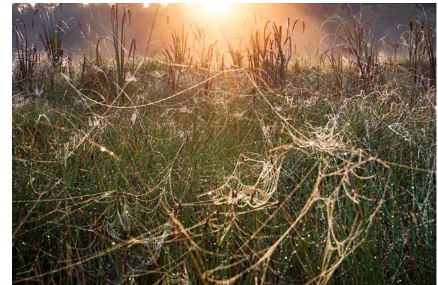
3rd Place - Cameron Wilcox Silver Strands