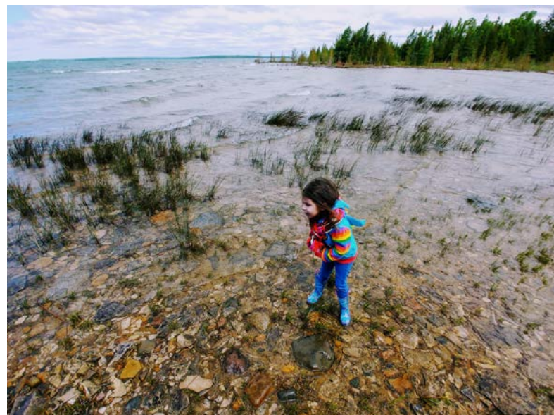
3rd Place - Brian Schmidt Dix Point, Drummond Island