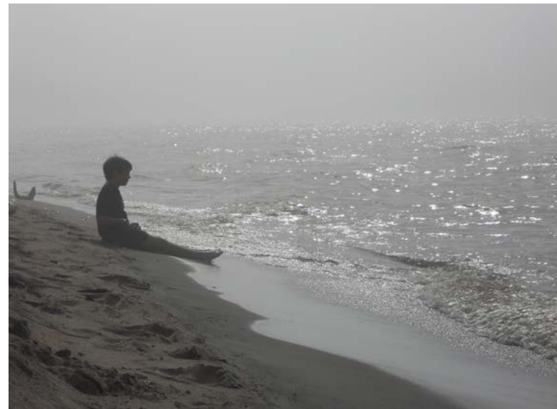
2nd Place - Warren Robords Foggy Beach