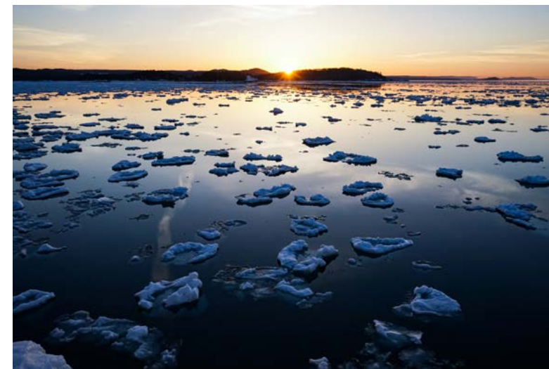
2nd Place - Cameron Wilcox Pancake Ice